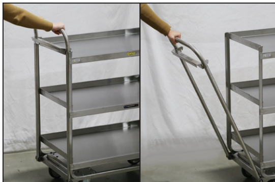
Swing-out handle allows for safe pushing or pulling action.