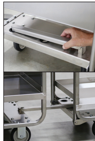
Optional On-Board Hitch Bar