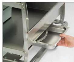
Drain Pan Holder