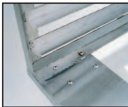
High strength heliarc welded ledges.