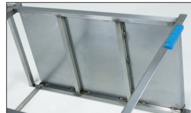
Shelves reinforced with square tubing.