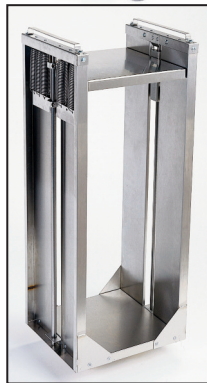
Removable dispensing unit