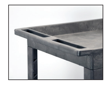
Integrated Push Handle