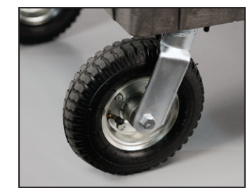
8" Pneumatic Casters