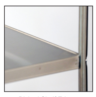
Dished Shelf Edges