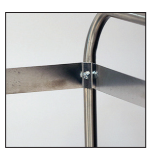
Rail Brace On 3 Sides (Model 6446)