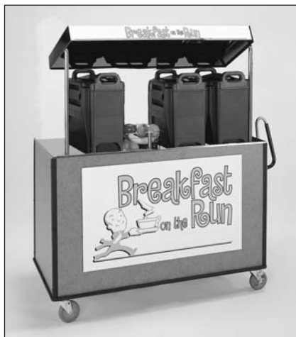
Front view show with optional merchandising panels.