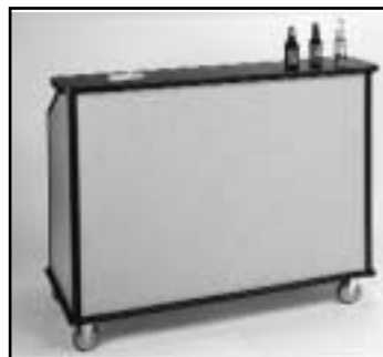
Model #889 front view.