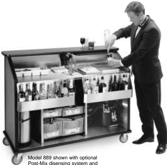
Model 889 shown with optional Post-Mix dispensing system and optional Bag-in Box rack kit.